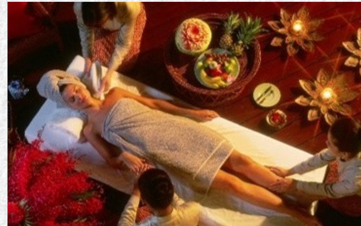
Health & Wellness