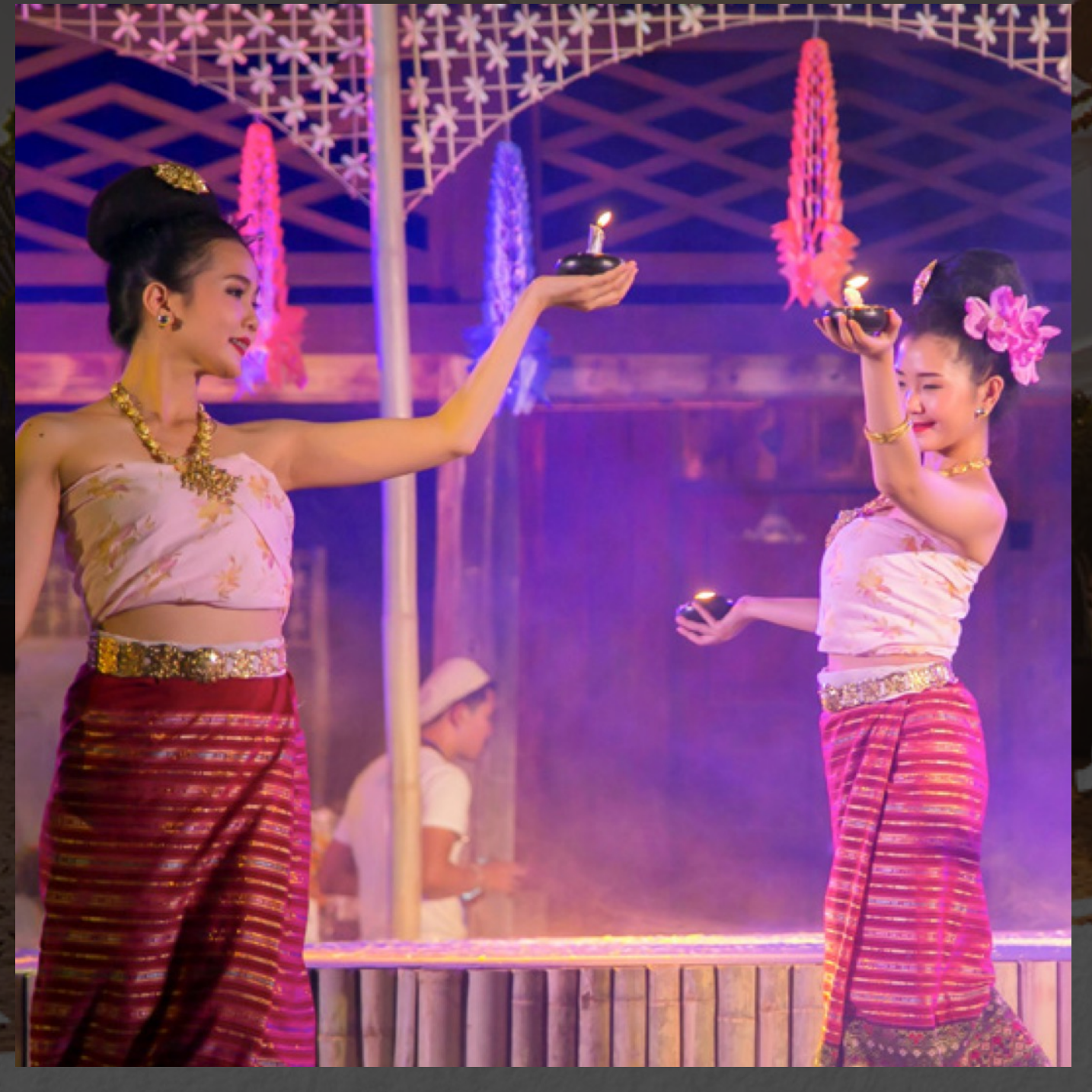
Khantoke 2 November 2023 Gala Dinner