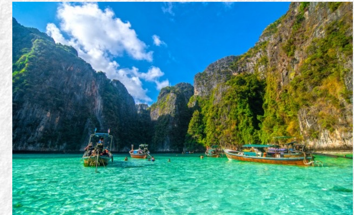
Beaches & Islands