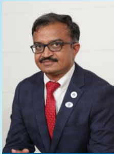
R. B. Jadeja