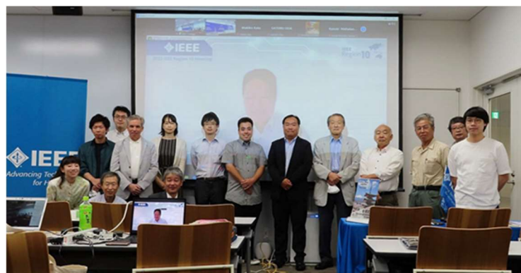
EA event “Learn cutting-edge-technologies in English”