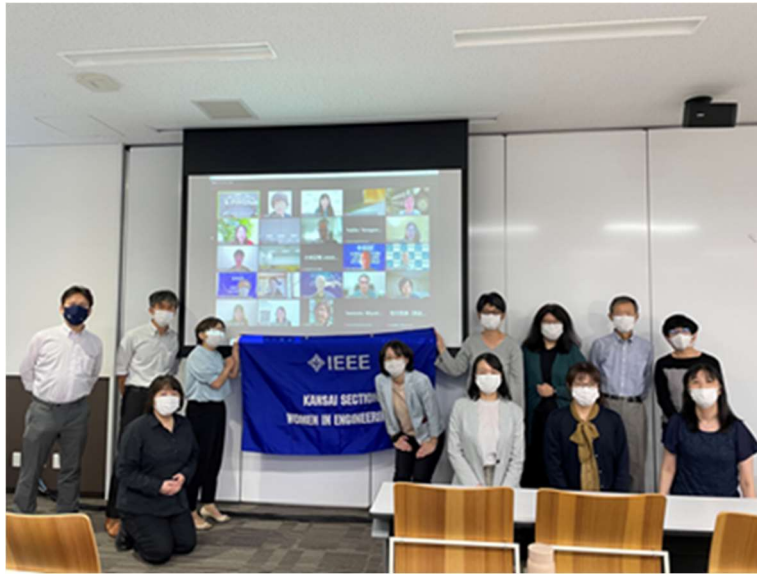
WIE Symposium 2022