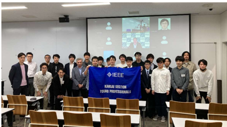
YP IEEE TOWERS in Kansai