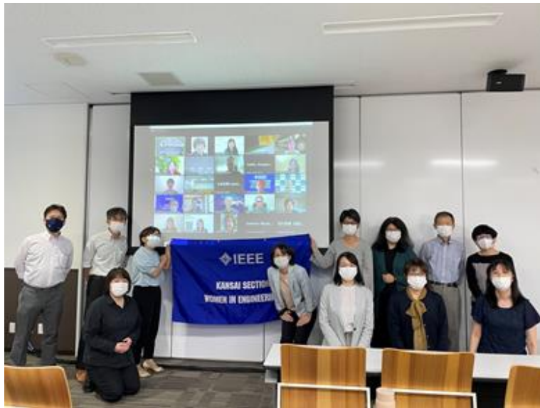
WIE Symposium 2021