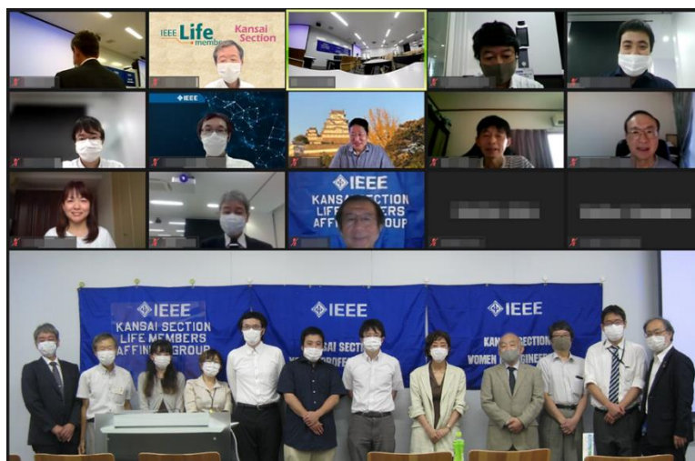
EA event “Learn cutting-edge-technologies in English”