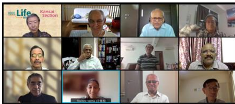
R10 LMAG Meet