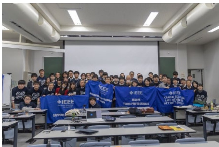
Photo 3. Japan SYWL Workshop in Sapporo on October 31 st (Onsite/Online-Hybrid Workshop with keeping “Social Distance” onsite)