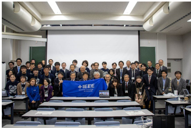
Photo 2. MAW2021 in Sapporo on October 30 th