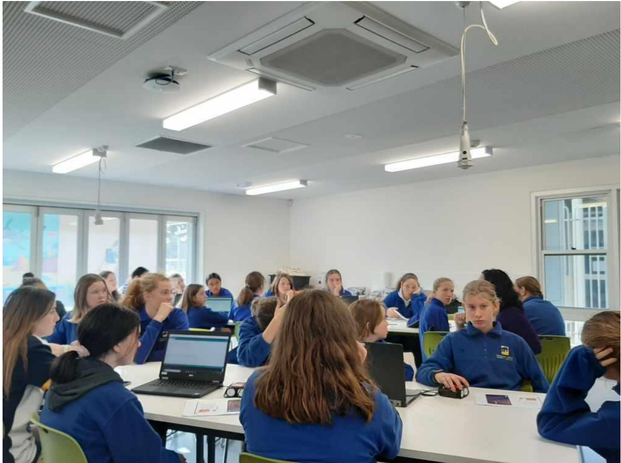
Visit to Kangaroo Island, 23-25 June 2021 by the WIE affinity group to promote STEM.