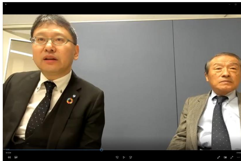
General Chair and Honorary Chair