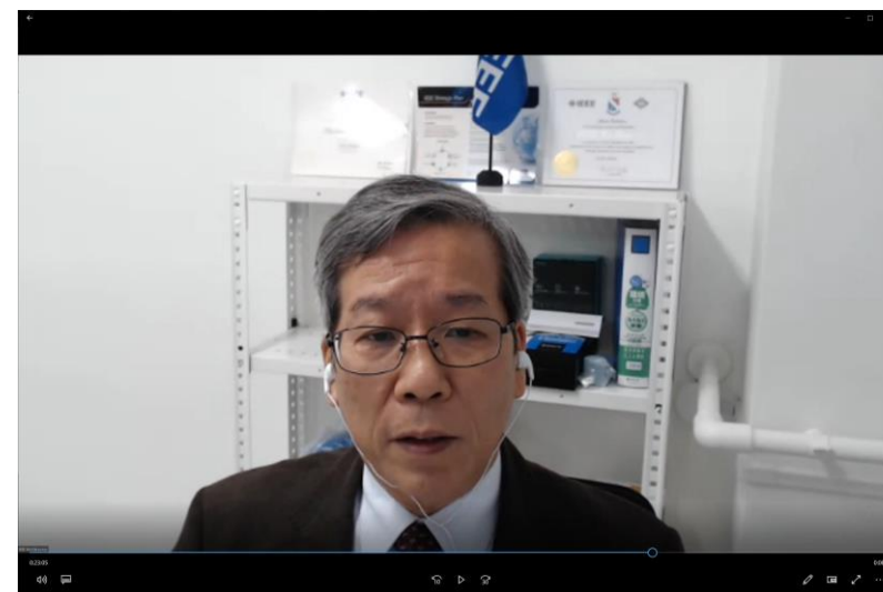
Region 10 Director