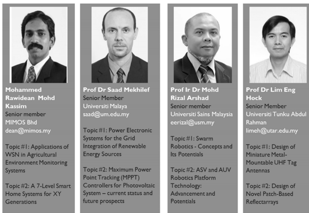
Figure A.1: MyDLP Speakers

A.1.2.6 IEEE Malaysia Distinguished Lecturer Program (MyDLP) speakers appointed in 2019 continues for the second year. The following are the four MyDLP speakers were appointed for 2019-2020.