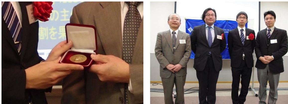
Photo 4. IEEE Kansai Section GOLD Awards