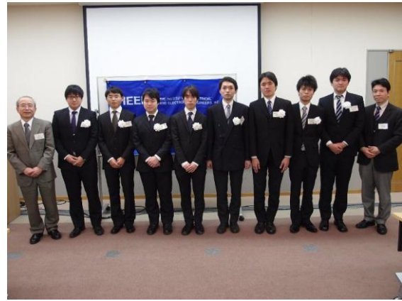
Photo 5. IEEE Kansai Section Student Paper Awards