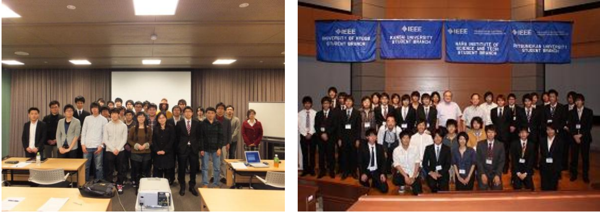
Photo 3. Left: a photo taken after the inaugural meeting of Doshisha University student branch in April, 2013, Right: annual English Presentation Competition at Ritsumeikan University in October 2013

Furthermore, we held joint meetings with the Membership Development Committee and provided activity support for GOLD members and women members.