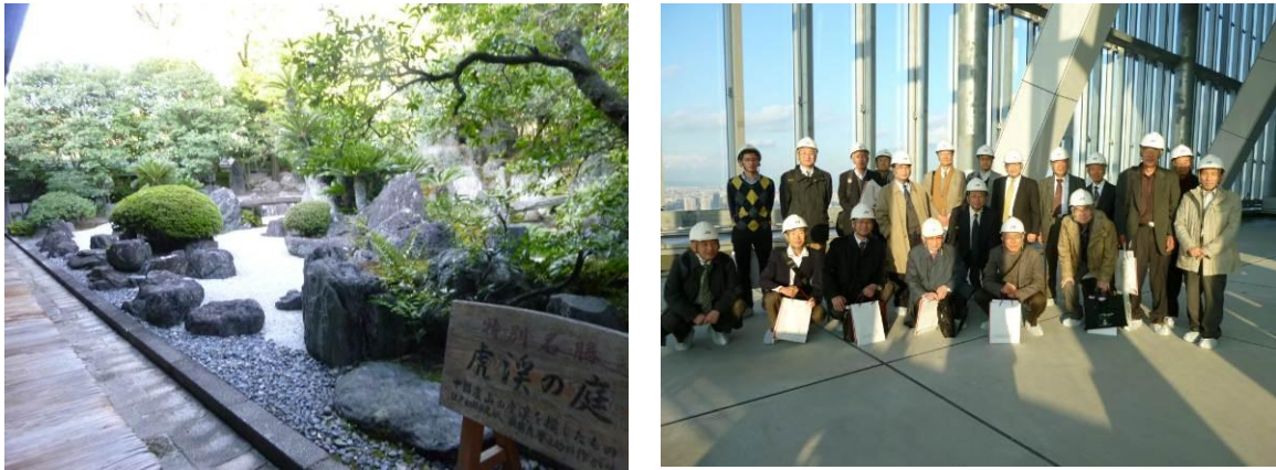
Photo 6. Left: Kokei no niwa (Tiger glen garden) in Nishi Honganji temple, Right: Abeno HARUKASU building, which was under construction

site” technical meeting. We issued “Kansai-LMAG Newsletter” in May and December by email and on the Kansai Section WEB. Through these activities, we have developed up-to-date LMAG members’ network.