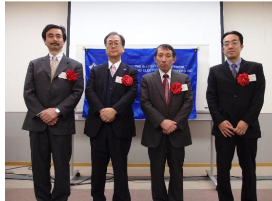
Photo 1. IEEE Kansai Section Medal recipients

The IEEE Kansai Section Medal is presented to new Senior Members. The medal is designed with a portrait of Gennai Hiraga, who was a multi-talented person, especially known as writer and inventor in Edo era, and assembled Japan's first electrostatic generator (called Elekiter), which used the power of friction to generate electricity. We presented the medals to eight new Senior Members at the annual section meeting (four of them were shown in the photo above) on February 17, 2014.