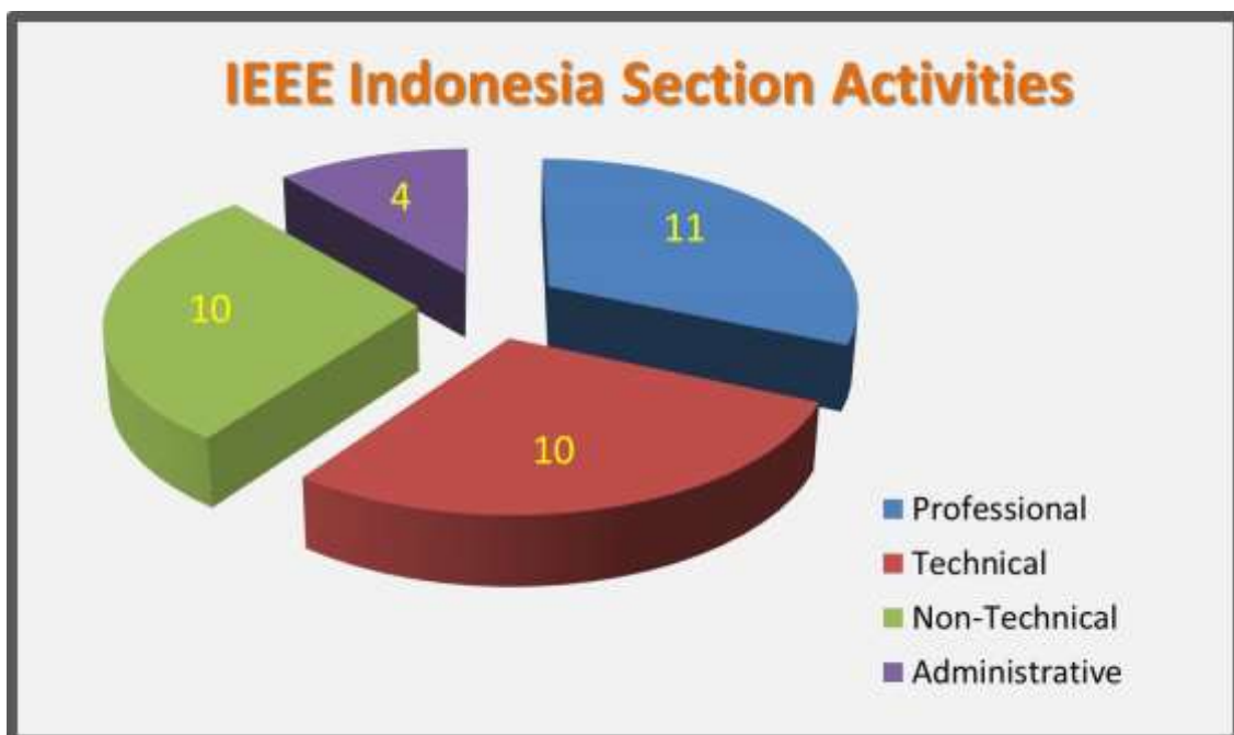
Figure 1. IEEE Indonesia Section Activities