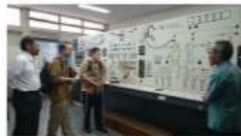
Manajemen dan Sistem Tenaga Listrik

kegiatan yang disebut juga sebagai IEEE PES Distinguished Lecturer Program yang bisa disebut dengan