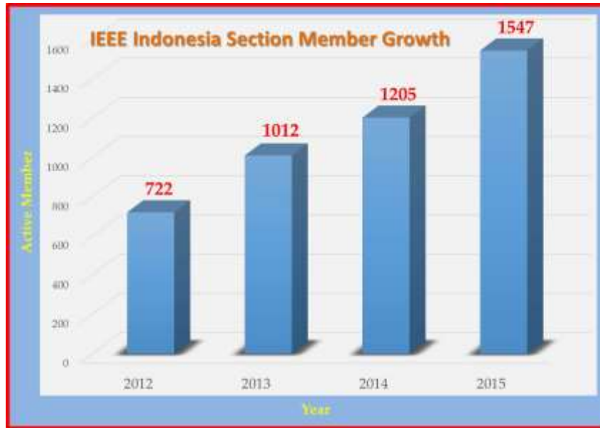
Figure B.1: Total Number of Active Members of IEEE Indonesia Section (2012-2015)

Last but not least, the increasing number of International conferences with Technical co-sponsored by IEEE Indonesia Section, also contributed to increasing of IEEE members in Indonesia Section.