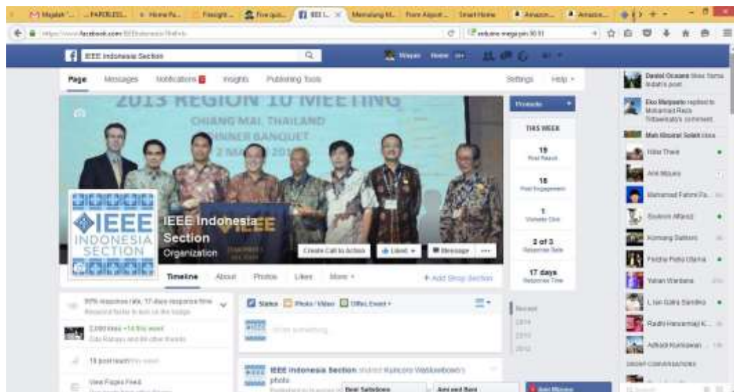
Figure B.5: IEEE Indonesia Social Media