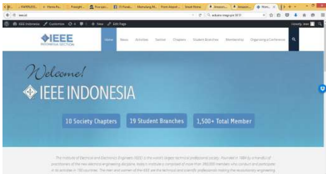
Figure B.4: IEEE Indonesia Website