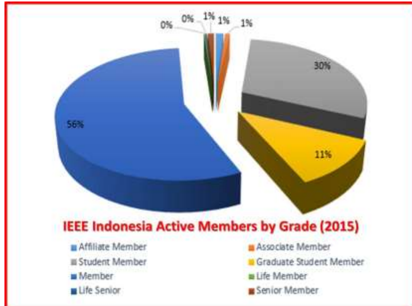
Figure B.2: IEEE Indonesia Active Members by Grade (2015)