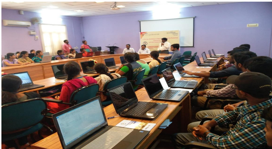
On 6 th March, Hands-on Workshop on Photoshop & Web development at Annamacharya institute of Technology & Sciences-Rajampet in collaboration with the YPAG