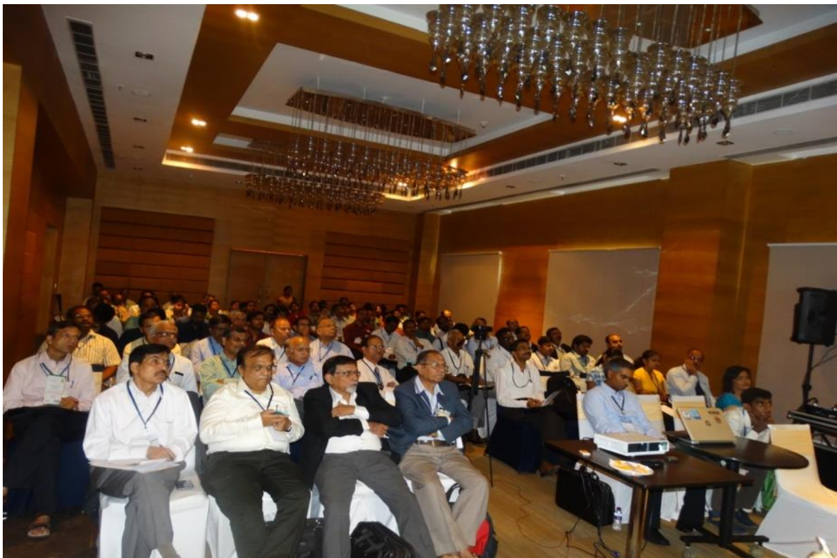
One day workshop on “UAVs/DRONES-Technological Advances and Innovations”-Held on 5 th Nov 2016 at Hotel Marigold, Hyderabad.