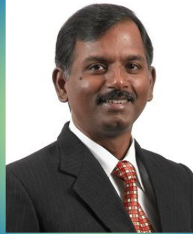
Arokiaswami Alphones Singapore Committee