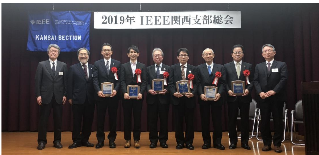
Supporting Friend Awards