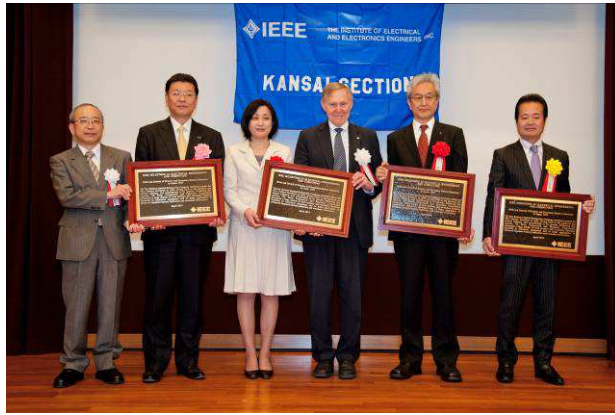
A photograph of the IEEE Milestone dedication ceremony on April 12, 2014 Birth and Growth of Primary and Secondary Battery Industries in Japan, 1893