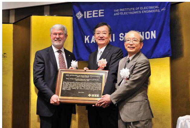
A photograph of the IEEE Milestone dedication ceremony on June 9, 2014 Sharp 14-inch Thin-Film-Transistor Liquid-Crystal Display (TFT-LCD) for TV, 1988