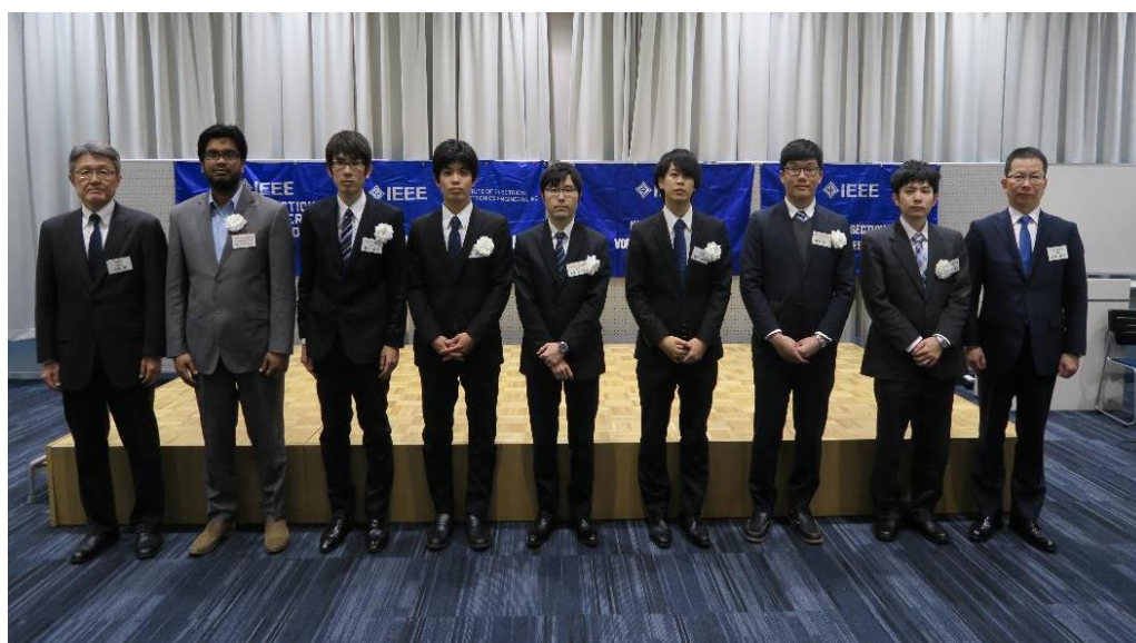
Student Paper Awards