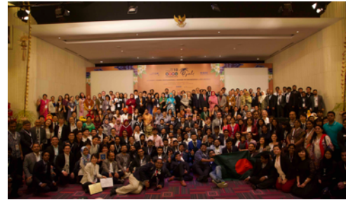
Group Photo of Awarding Night