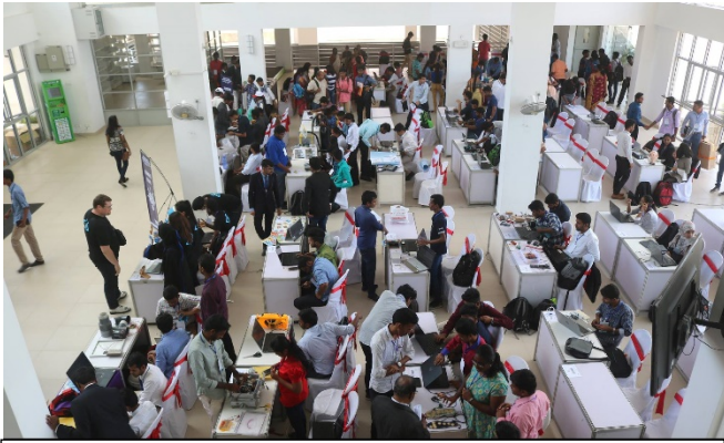
IEEE SS12 Project Exhibits