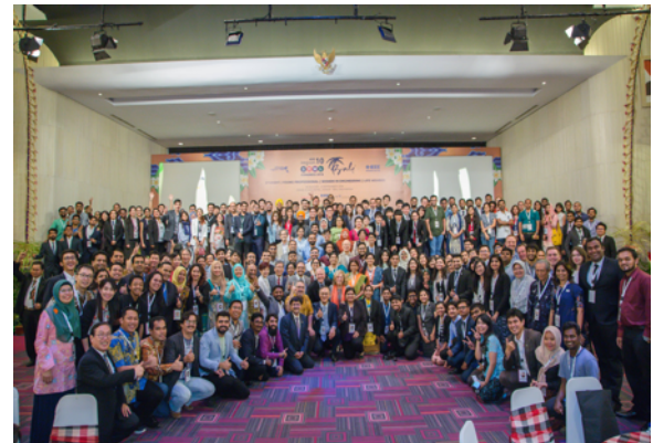
Group Photo of Opening Ceremony