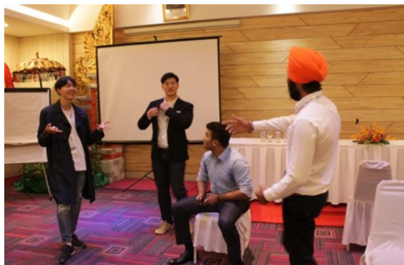
Networking Session-'Living in the Future': Skit presentation