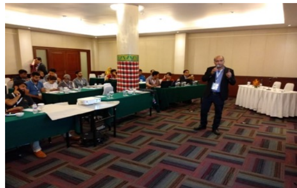
Speaker conducting the workshop

The expected outcomes from this workshop were to set a path for the attendees to enhance their skills in humanitarian projects, reducing the risk of wasted work and failed projects. The idea was that professionals and students in greater numbers than ever before are entering the field of humanitarian engineering for global development and many were unprepared.