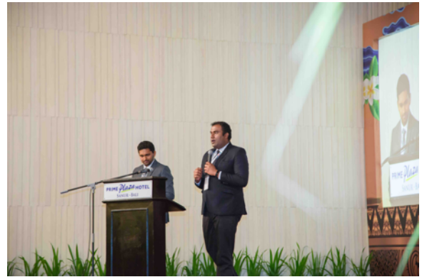
Program at Glance by Program Committee of IEEE R10 SYWL Congress 2018, Nivas Ravichandran