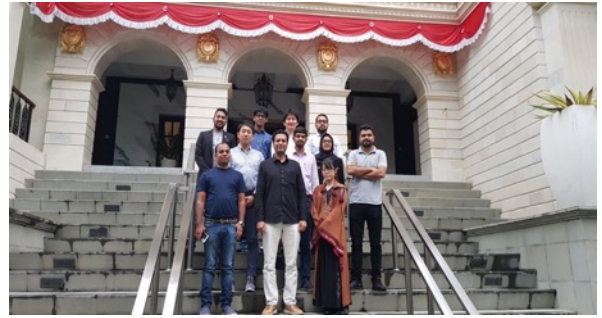
Entrepreneurship Catalysts Workshop Participants at the Venue