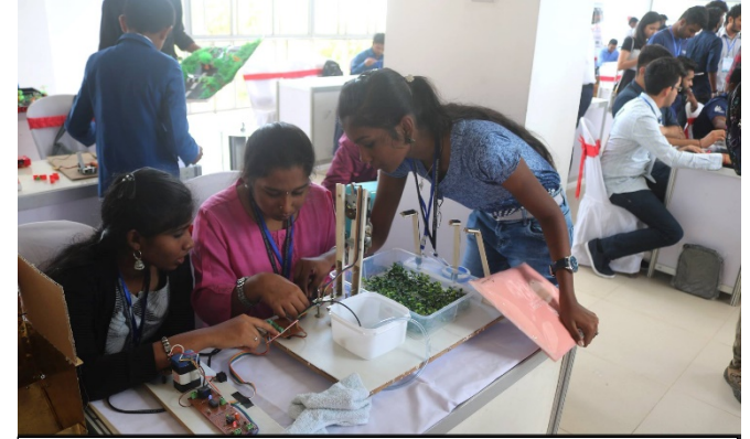
Women Junior Einsteins