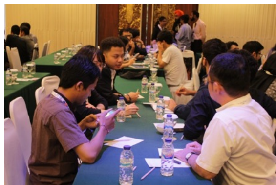
Networking Session-'Living in the Future': preparation in progress