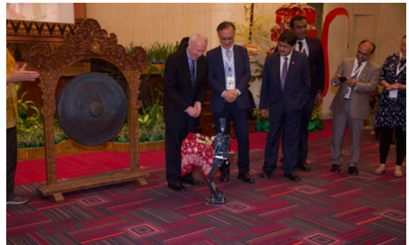
Opening Ceremony of IEEE SYWL Congress 2018