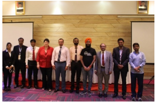
IEEE Region 10 SAC team 2018 with the delegates

Along with it, the Certificates to the winning teams of “Living in the Future” Networking Activity held during the Student Track were also presented.