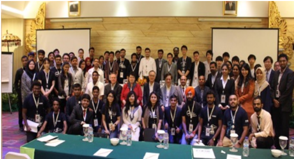
Group Photo of the participants of the SAC track