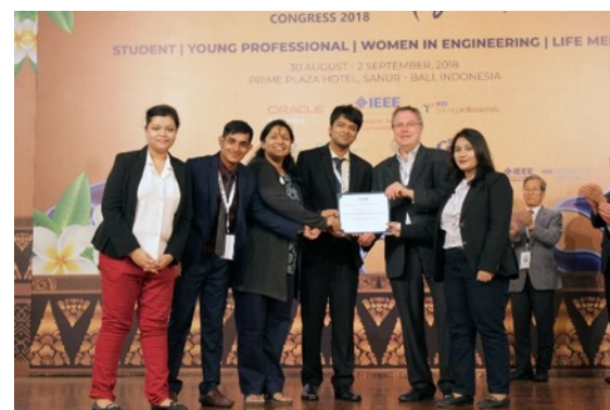
IEEE AIUB Student Branch and IEEE North South University Student Branch is receiving award of MGA Region 10 Exemplary Student Branch 2017 and 2018 respectively

During the Awards Night on 31st August, the IEEE R10 SAC Awards for 2018 and MGA Awards for 2017,2018 were presented. The recipients for these awards were: