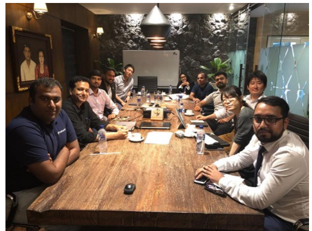
Participants Discussing Entrepreneurial Issues