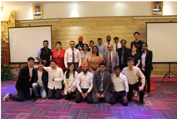
Winning 2 Teams of the Networking Activity “Living in the Future” along with the judges

Along with it, the Certificates to the winning teams of “Living in the Future” Networking Activity held during the Student Track were also presented.